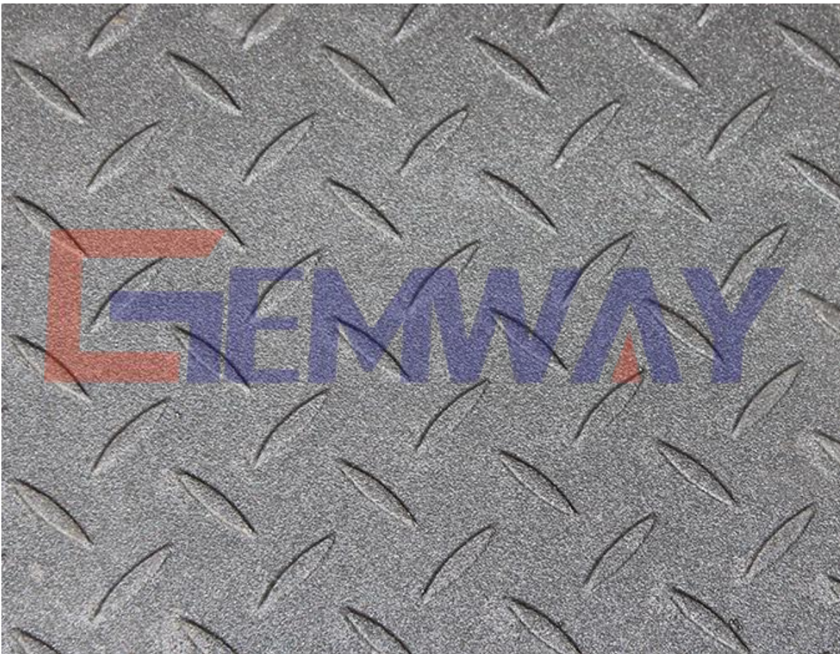
Manual De-Rusting (Finished)